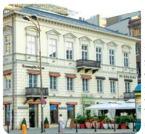
Warsaw, Dom Dochodowy o Trzech Frontach